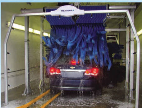
The Quad Wave Mitter TM washes vehicle fronts, tops & backs – for a full-size clean in only 7 feet of bay space