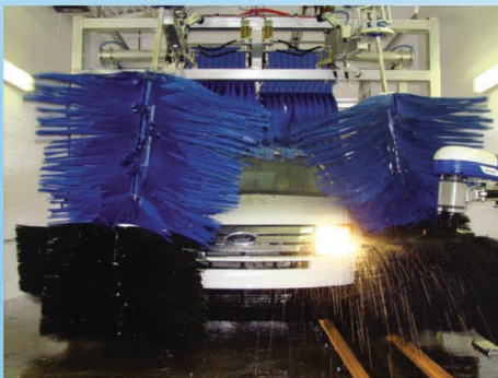
'Porter Proof' side wash wheels are "Built to Tilt" SM through a full 360°, using a patented oversized socket joint