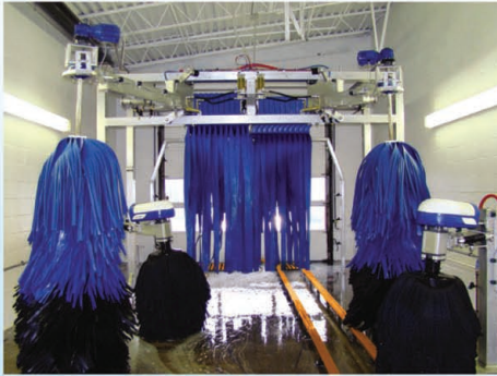
The insta-KLEEN TM fits into bays as short as 25 feet – even an existing service bay, for maximum flexibility

Simply put, with the insta-KLEEN, 'if you can drive the car, you can wash it.' Any employee can wash cars as needed – whether it's a salesperson, mechanic or porter – with a minimum of training. And because the wash takes only 60 seconds, the payroll expense is both minimal and well-distributed.